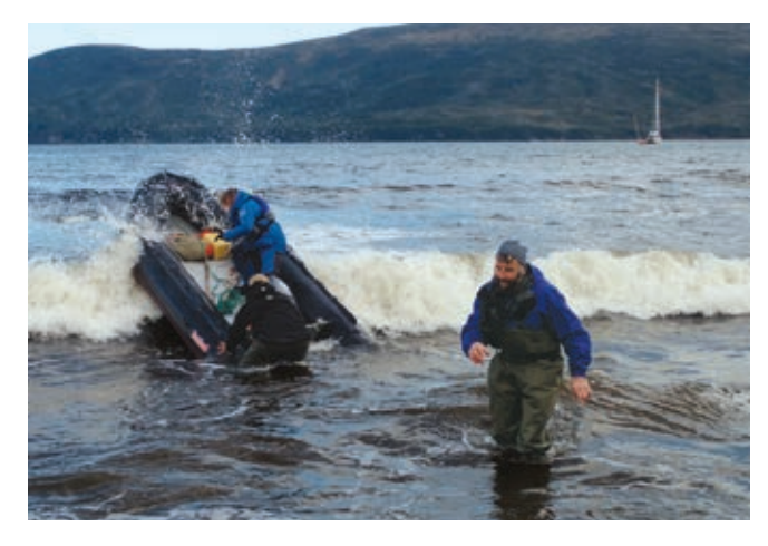
Re-launching the dinghy off the beach was wet work. We lost count of the trips in and out while ferrying Mira 's gear out to Pelagic Australis .